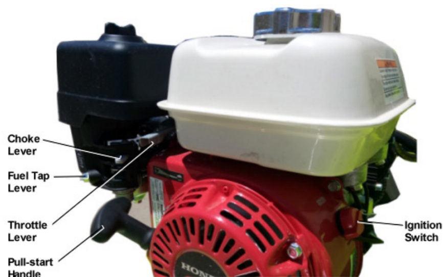
Figure 3 – Engine Start-up

If the FireAttack is not going to be used within the next few hours, shut the system down by turning the fuel tap to OFF.