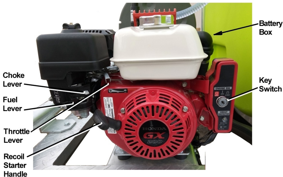
Figure 2 – Engine Start-up (Petrol Engine shown)