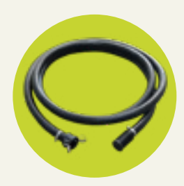
6m Suction Fill Kit

Fill The Tank Through Your Pump Quickly From External Water Source