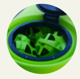
LiquidLocker <sup>™</sup> Baffle System Fitted

Rubber mounted to reduce vibration, a Genuine Honda GX200 Petrol Engine with Davey Twin Impeller Pump