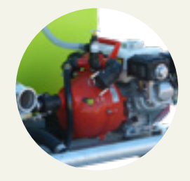
Reliable Honda Engine and Davey Pump

Rubber mounted to reduce vibration, a Genuine Honda GX200 Petrol Engine with Davey Twin Impeller Pump