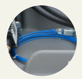
Anti Static Earth Strap

Pad lockable locking latch for lid, to protect your investment!