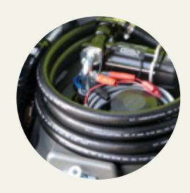
Kink Resistant Delivery Hose

4m or 6m Delivery Hose. ensuring you can easily reach your equipment!