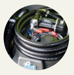
High Flow Pumps

4m or 6m Delivery Hose. ensuring you can easily reach your equipment!