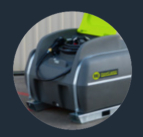
Steel Frame Options

Fits to all Diesel units Measure the Flow of Your DieselCaptain™