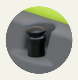
Unique Tank Breather System

A unique tank breather system prevents the tank from suckina in