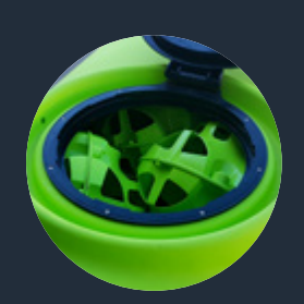
LiquidLocker™ Baffle System

Fitted to Prevent Liquid Surge While Travelling