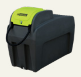
400 Litres (Slim)