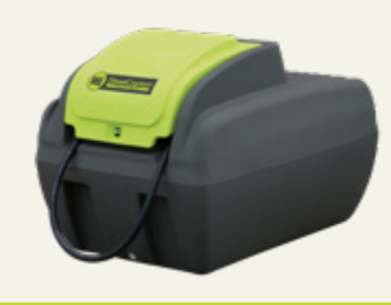
400 Litres (Standard)