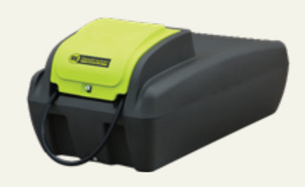
600 Litres (Standard)