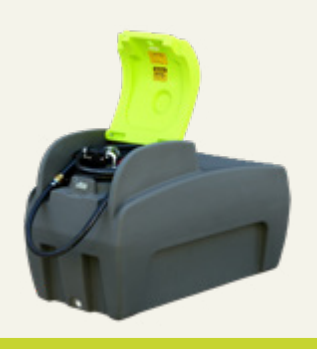
300 Litres (Slim)